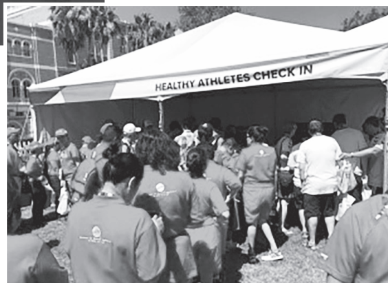
Check-in tent for the Special Olympic athletes on the campus of USC.

vehicle to showcase the skills and dignity of athletes, overcoming everyday barriers and bringing communities together to see and be a part of the transformative power of sports. Special Olympics believes in our world there are millions of people with different abilities not disabilities. Special Olympics believes many valuable lessons can be learned from sports, some of which are the joy in learning to dream when we train and strive for a goal, the self determination, and willpower to keep going when we suffer roadblocks, setbacks and losses before reaching our goals.