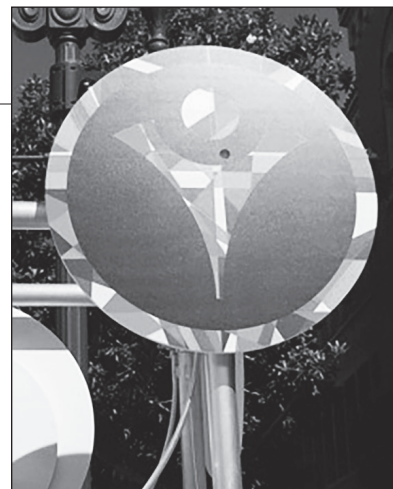
The celebratory figure in the 2015 Los Angeles Special Olympics logo represents the courage, determination and joy of the Special Olympic athlete.

While some may ask what does this have to do with sports, they should know that Special Olympics mission to raise awareness about the abilities of people with intellectual disabilities uses sports as the