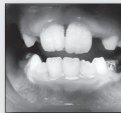
2 Weeks Post Treatment

Although it was a traumatic event for our patient and her family, I was glad that I had the knowledge from the ASD to be able to provide the appropriate treatment in such a timely manner.