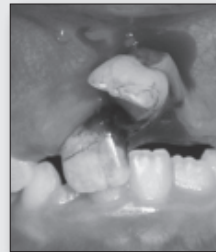
1 Hour Post Trauma

seven year old daughter was playing in the gym at school, got entangled in a badminton net, and displaced one of her front teeth. I said to bring her right down to our office. I was expecting to see a very loose deciduous tooth. I was shocked to learn that her maxillary left central incisor was laterally extruded about 90 degrees – it was looking right at me! After reassuring the patient and her parents what I felt would be the appropriate treatment, I proceeded by administering local anesthetic. Then I repositioned the tooth using my forceps. I splinted the tooth to her adjacent teeth and advised the parents to bring her back in about two weeks for reassessment and to remove the splint.